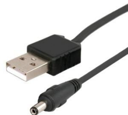
USB power cable