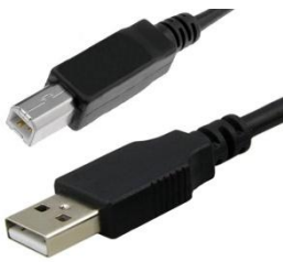
USB data cable

In this case, please also connect the additional USB power cable between your DVD drive and another free USB socket on the computer.